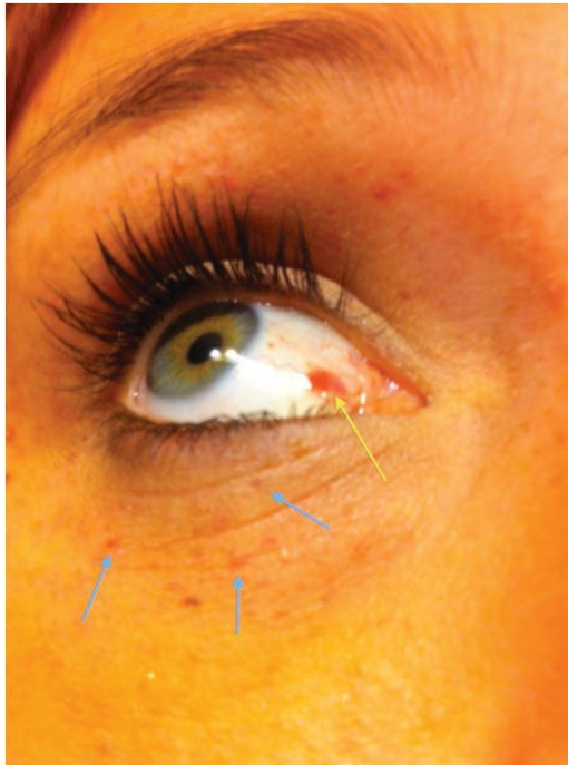
Figure 4. Photograph depicting participant's periorbital petechiae and subconjunctival hemorrhage.