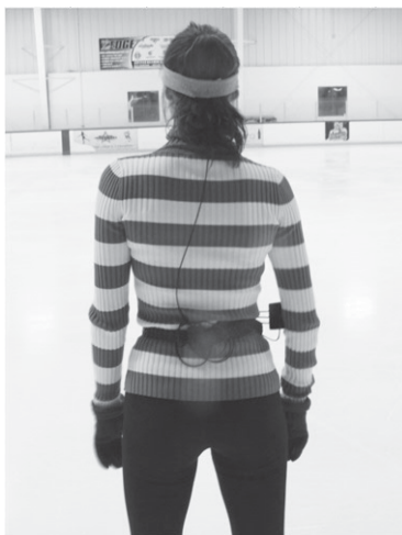
Figure 1. Accelerometer placement.

Data collection: The participant was asked to perform seven different spinning elements that she was experi-