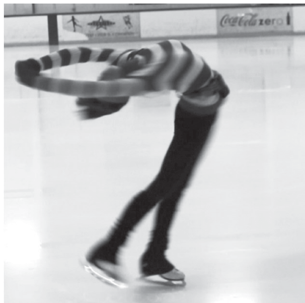
Figure 2. Layback spin.

The layback spin (Figure 2), produced a sustained -2.2G upon entry into the spin, and then produced a